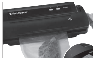
Close and Latch Lid