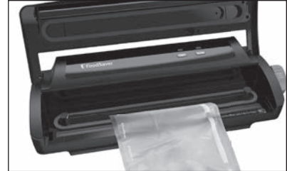
Place Bag on Sealing Strip

Now you are ready to vacuum package with your new bag (see next page).