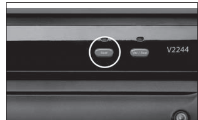
Press Seal Button