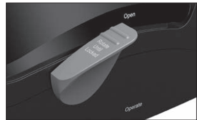
Close and Latch Lid