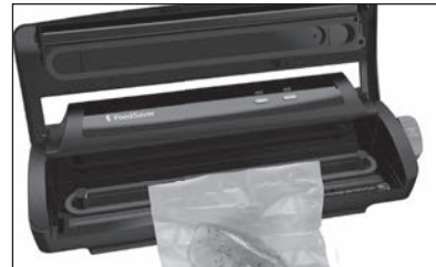
Place Bag in Vacuum Channel

As you become familiar with the unit you can minimize bag waste by inserting the bag just over the edge of the removable drip tray.