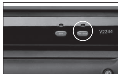
Press Vacuum & Seal Button