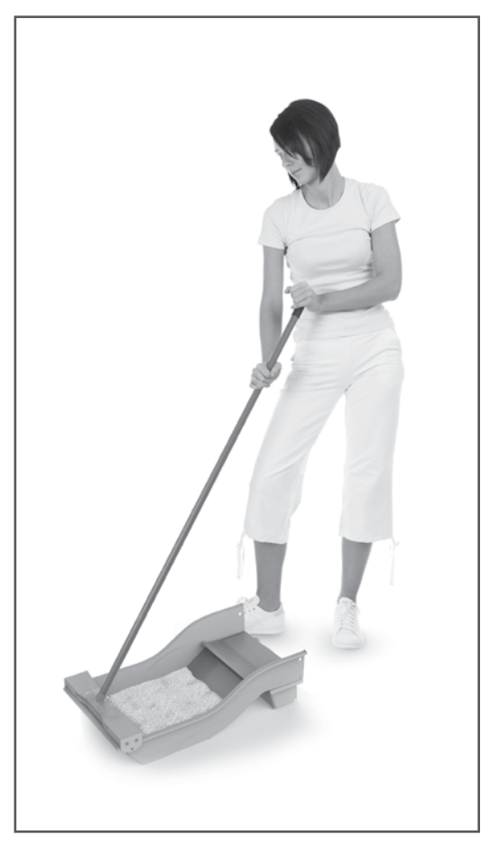
Shown with broom attachment